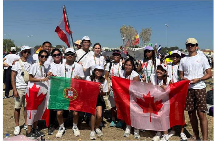
World Youth Day 2023 reflections & photos